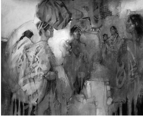
Maya of Chichicastenengo VII in the Southern Watercolor Society Exhibition.